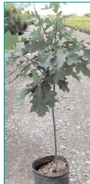
Volunteer planting 1 yr. old RPM trees from #3 pot.